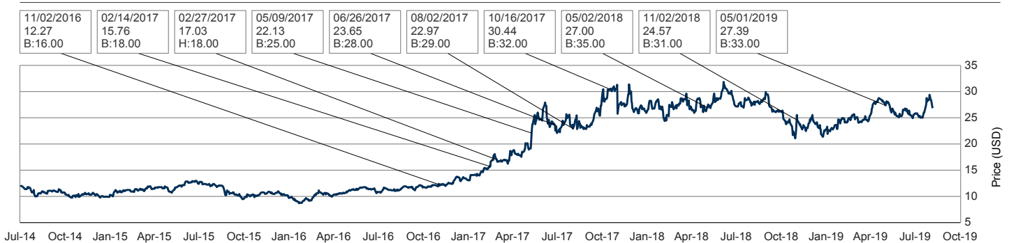
Nova Measuring Instruments Ltd. (NVMI) as of August 06, 2019 (in USD)